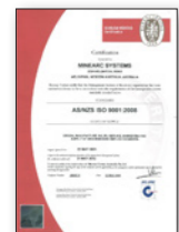
Bureau Veritas ISO 9001:2008 Quality Management Systems