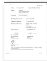
MineARC HRM Refuge Live Risk Assessment Testing