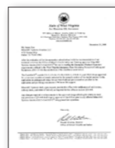
WV Office of Miners' Health, Safety & Training Approval