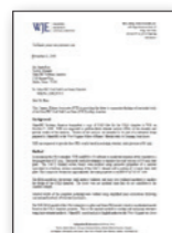
WJE, Inc. Independent Blast and Structural Analysis