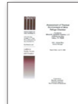
IHST, Inc. Independent Human Testing