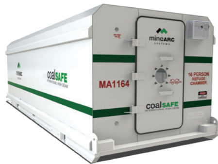
CS-IHS2-16-IS-48 with airlock (16 Person)