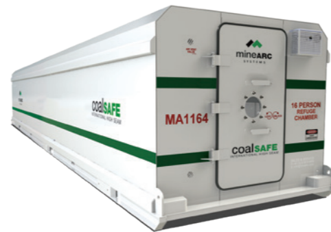
CS-IHS3-20-IS-48 with airlock (20 Person)

Custom dimensions and occupancies available. Refuge dimensions are ultimately designed to client specifications. Standard models based on International high seam mine specifications and 48 hour occupancy.