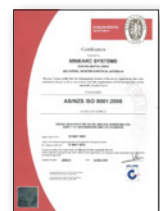
Bureau Veritas ISO 9001:2008 Quality Management Systems