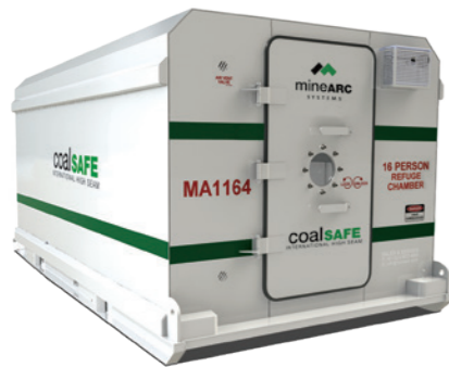
CS-IHS1-12-IS-48 with airlock (12 Person)