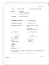
MineARC Team Based Risk Assessment Testing