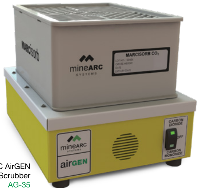
MineARC AirGEN Standalone Scrubber AG-35