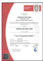
Bureau Veritas ISO 9001:2008 Quality Management Systems